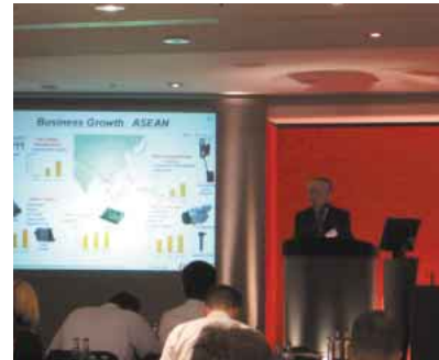
Company orientation for shareholders (London)

Structure of information flow from DENSO to shareholders and investors