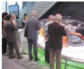
Exhibition at the lobby