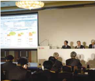
Company orientation for shareholders (Tokyo)

We not only adhere to the required legal standard of information disclosure, but we quickly and fairly offer information via several kinds of media. Since fiscal 2003, we have announced quarterly financial settlements and posted them under investors' information on our website. We also send news emails via the Internet to those who request them and report financial information, as well as progress in business operations, in a timely way. Moreover, we provide detailed information about management policy, plans, and performance in the business report and the annual report (English edition), and strive for mutual communication with investors and shareholders by conducting questionnaires both in print and through our website.