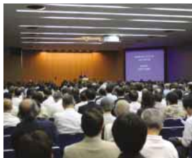
The annual general meeting of shareholders

At the Annual General Meeting of Shareholders, we use a lot of visual materials, helping shareholders to better understand our business conditions. We also set up a display booth to explain our business operations and posted the video of the shareholders' meeting on our website.